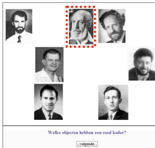
Figure 1: A trial in the people domain.

A first manipulation of the target properties was that trials occurred in two different types of domains: the furniture domain and the people domain. For an example of a trial in the people domain, see figure 1.